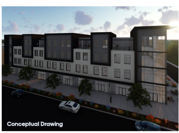
Conceptual Drawings Courtesy of Equip Studio, Inc. | www.equipstudio.com