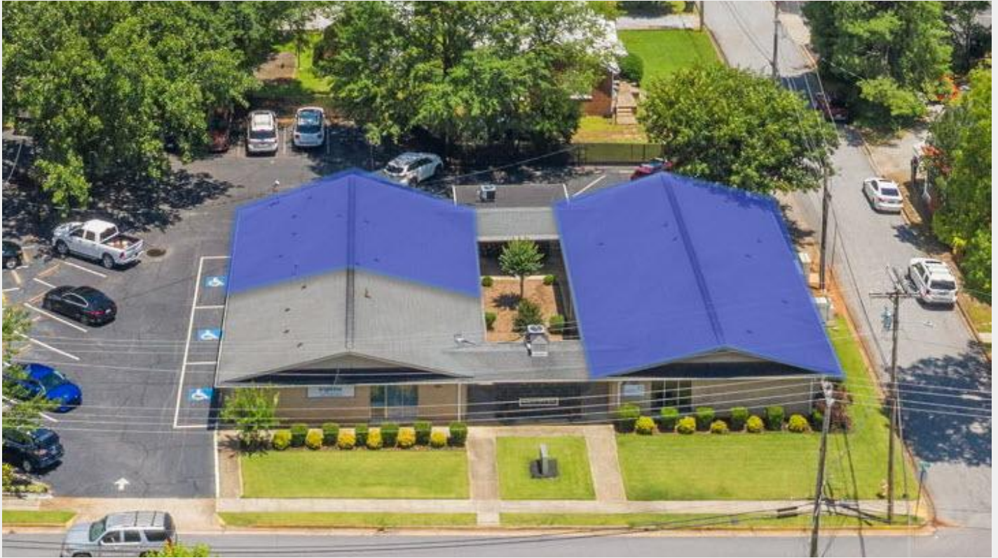
SHADED AREAS COMING AVAILABLE FOR OWNER-OCCUPANT